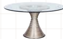
WILLOW P752B Dining Table Base W 30 D 30 H 29 Stocked Finishes: Antique Silver, Milk Paint (Base Plate: Powdered Bronze or Powdered Brass) Personalized Finishes Available (no wood stains) Top Sizes: (R) 54, 60, 72 (SG) 54 (ST) 54