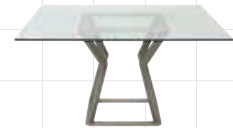
ALVIN W739B Dining Table Base W 25 D 25 H 29.5 Stocked Finish: French Metal Personalized Finishes Available Top Sizes: (R) 48, 54, 60 (R) 48, 54, 60 (SG) 54 (ST) 54