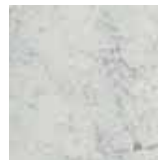
WHITE CARRERA STONE (Flat Edge) ST 54