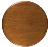
ASH HAND-PLANED (Ogee Edge) R 48, 54, 60