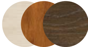
MILK PAINT, SPICE OR WEATHERED SHINGLE Ash Hand-Planed (Ogee Edge) or Elm Smooth (Flat Edge) Ash Sizes: R 48, 54, 60 Elm Sizes: R 40, 48, 54, 60