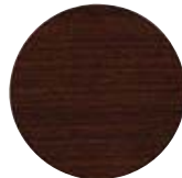
ELM SMOOTH (Flat Edge) R 40, 48, 54, 60