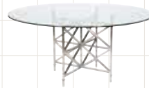
FRANKLIN W727T Dining Table Base W 29.5 D 29.5 H 29.25 Polished Stainless Steel Top Sizes: (R) 40, 48, 54, 60 (R) 42, 48, 54, 60 (SG) 54 (ST) 54